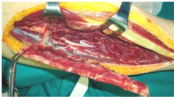
Figure (4) Fibula flap is still in place connected to its pedicle