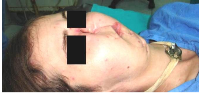
Figure (3) Pre-operation profile